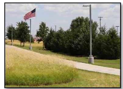
City of Hobbs - Lovington Highway Health Trail