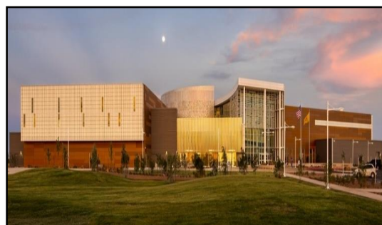
The CORE is a state of the art facility that enhances the quality of life, provides economic development and improves the health of area residents. An intergenerational place for our residents and guests in our community which offers indoor, year-round opportunities for social interaction, learning, fun and fitness for all ages and abilities.