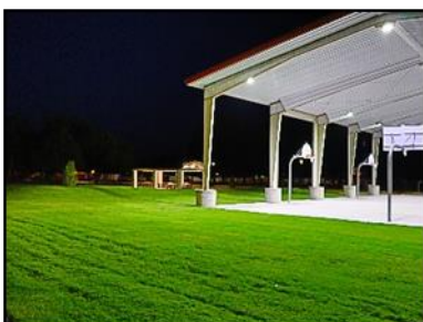
City Park Basketball Courts at night.