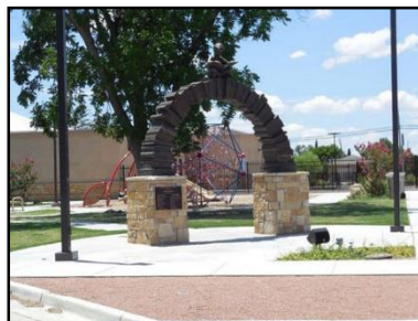
City of Hobbs Public Library