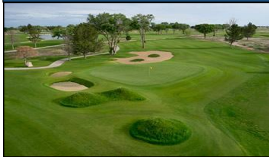
Rockwind Community Links, is a 27-hole golf facility owned and operated by the City of Hobbs