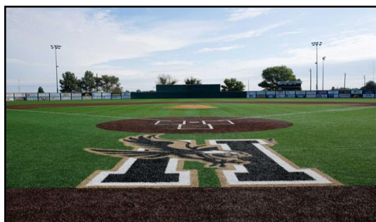
Enjoy a professional turf experience at the Veterans Memorial Softball and Baseball Complex.